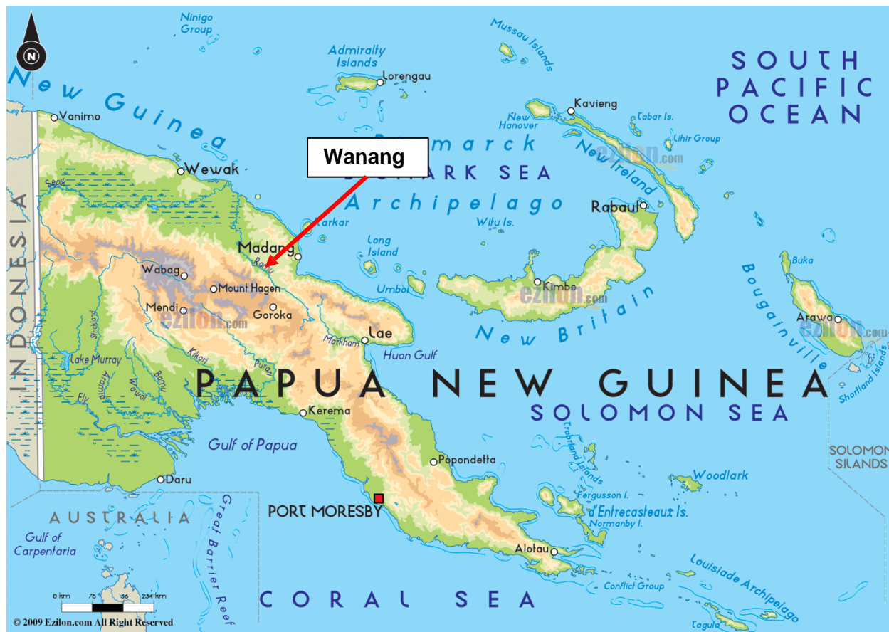
Map of Papua New Guinea, showing position of the project focal site at Wanang (Latitude:-5.25, Longitude:145.267). For further site details, see Center for Tropical Forest Science website: http://www.ctfs.si.edu/site/Wanang and Wanang Conservation Area website: http://www.entu.cas.cz/png/wanang/homepage